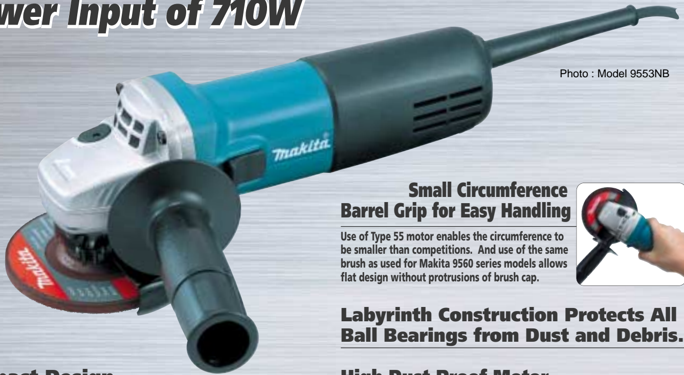
Photo : Model 9553NB