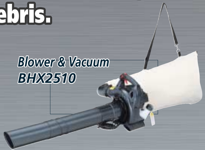
Blower & Vacuum BHX2510