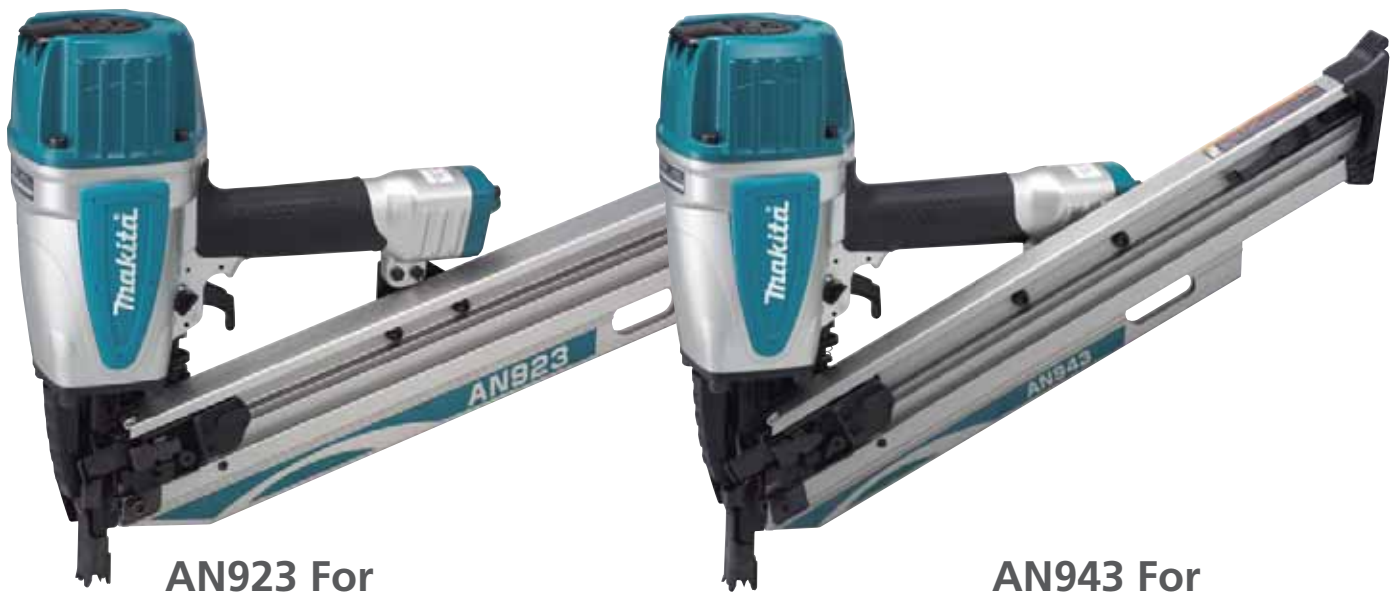
AN923 For Full Round-Head Nails