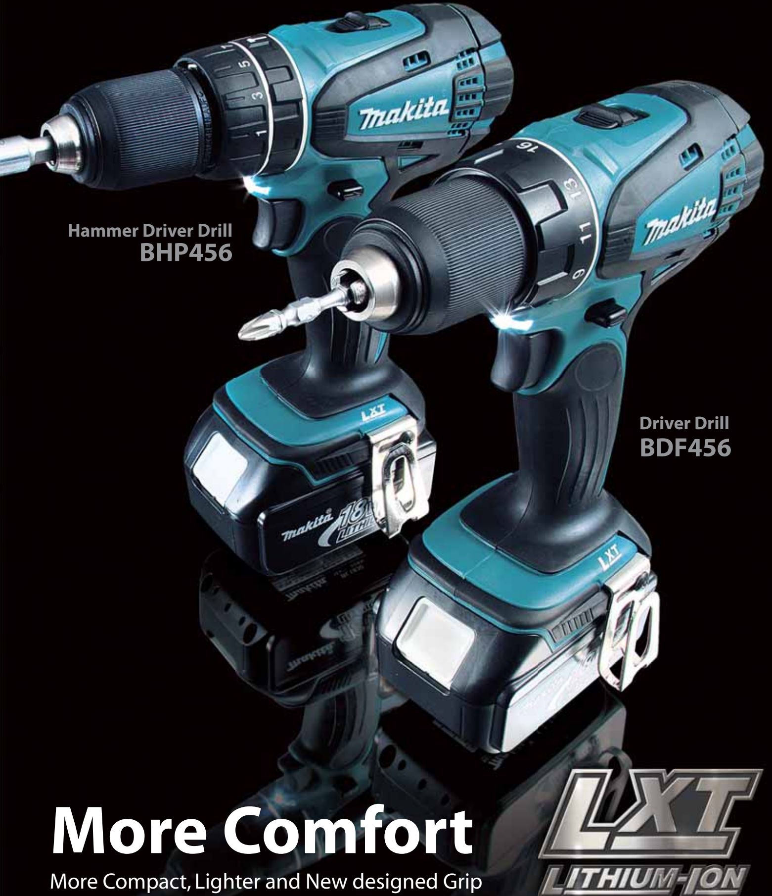
Hammer Driver Drill BHP456