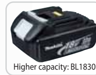
Higher capacity: BL1830

Allows to shoot 3,000/ 1,300 (BL1830/BL1815) pin nails on a single full battery charge.