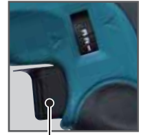
Variable speed control by trigger

Optimum air volume can be selected to suit your application from High/ Medium/ Low by changing the pull length of switch trigger with simple operation of adjusting dial.