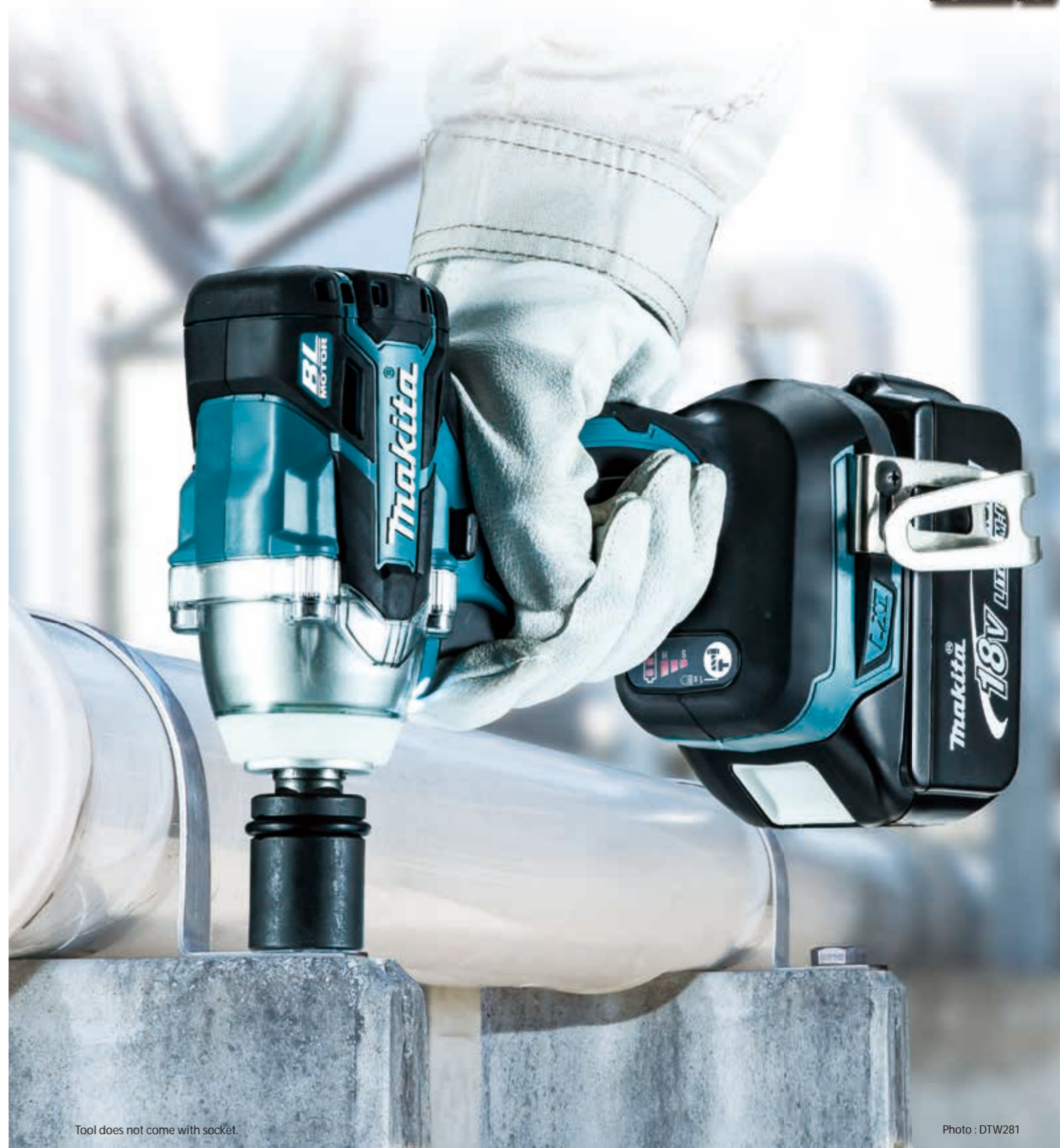
Tool does not come with socket.