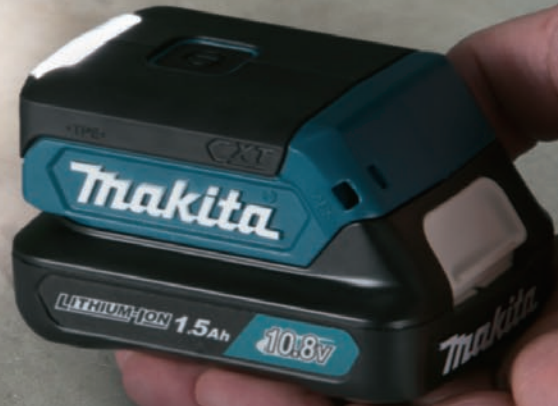
Battery is option