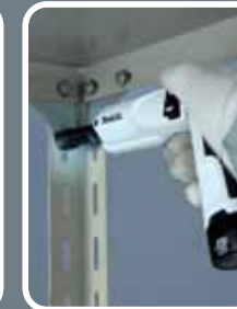
Fasten bolts (Socket bit is available as option)