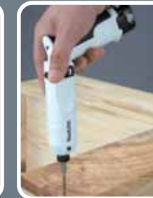
Drill pilot holes