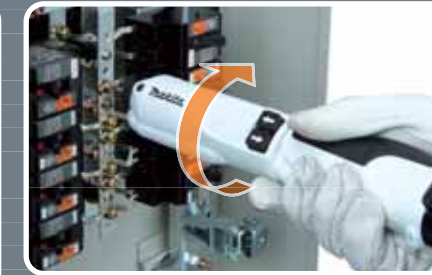
Hand Screwdriver Can be used as hand screwdriver