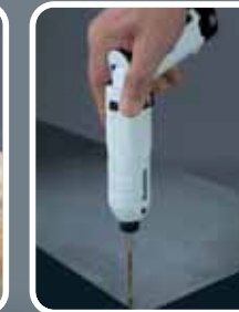
Drill in steel