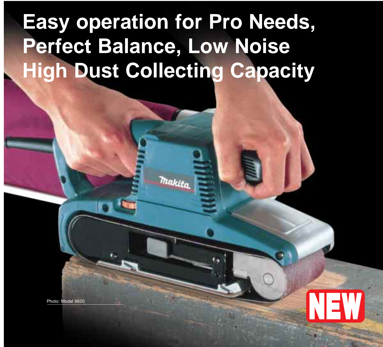
Photo: Model 9920

Easy operation for Pro Needs, Perfect Balance, Low Noise High Dust Collecting Capacity