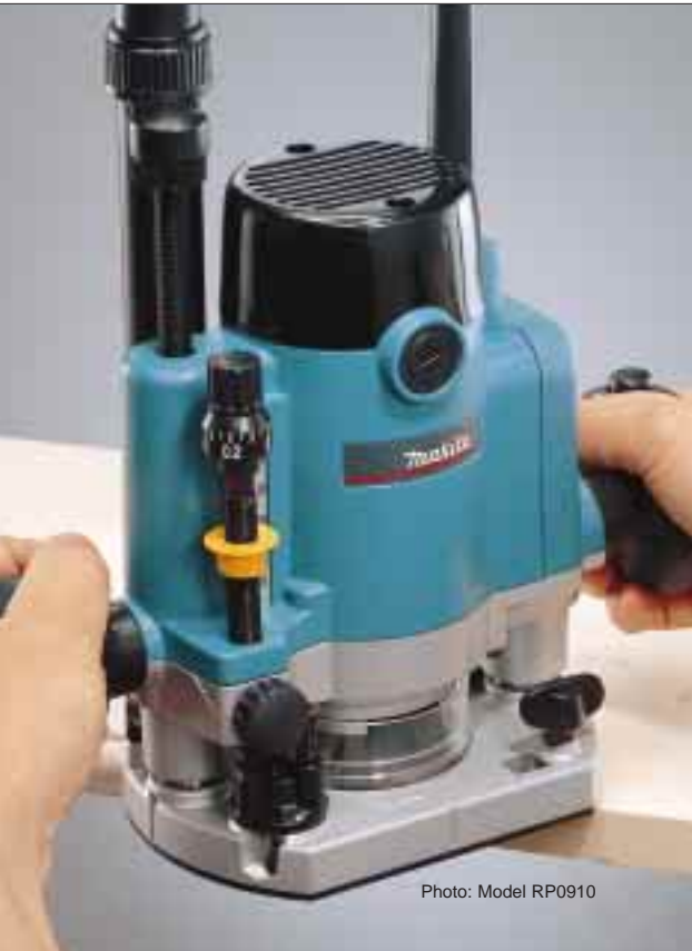
Photo: Model RP0910

Designed extremely compact to make finer work easier.