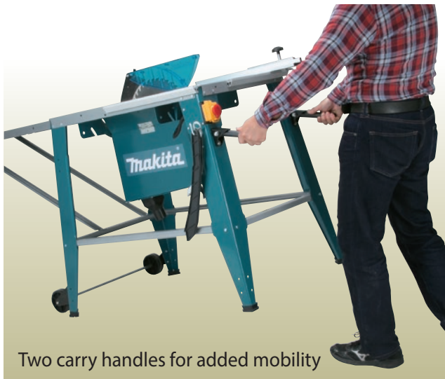
Two carry handles for added mobility