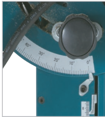
0-45 degrees bevel cut